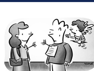
"If you could fill out the attached survey that would really help me out."